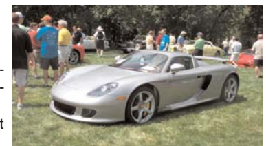
Ault Park 2004